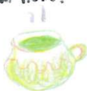
Grape Oolong Tea