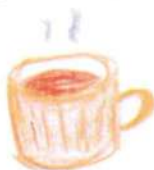
Peach Darjeeling Tea